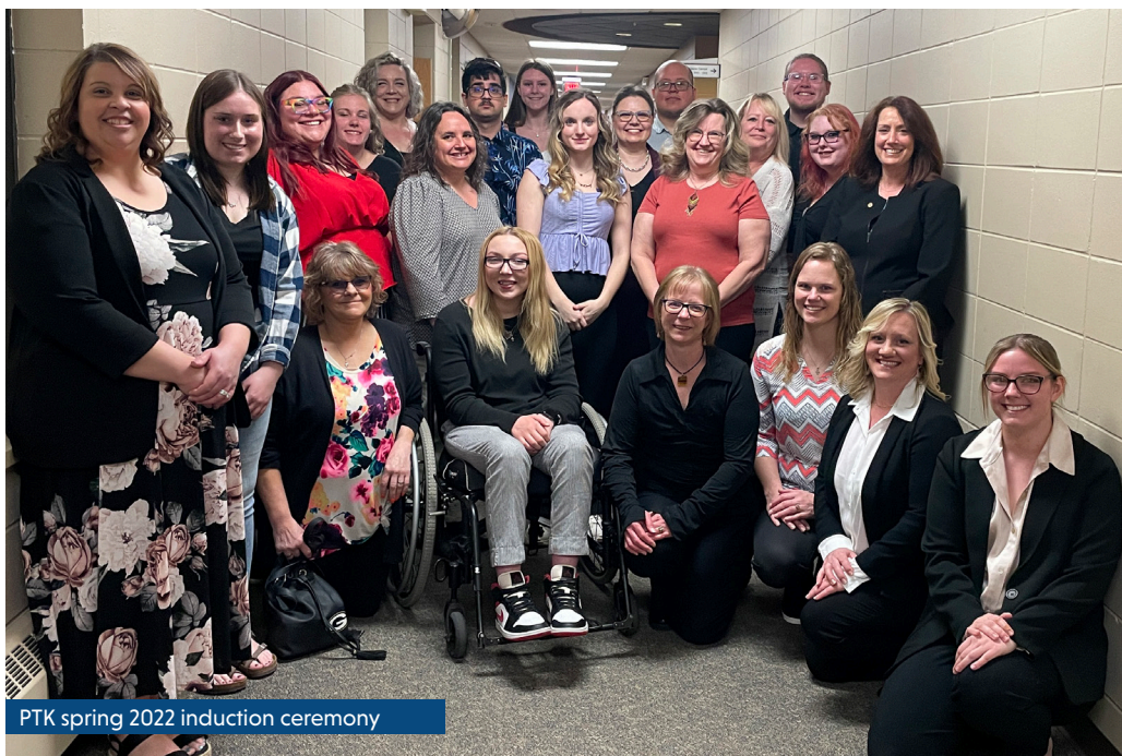
PTK spring 2022 induction ceremony

PTK, tailored for two-year institutions, connects students nationally to transfer and career resources, offering significant scholarship and leadership opportunities, and enhancing their recognition in competitive academic and employment searches.