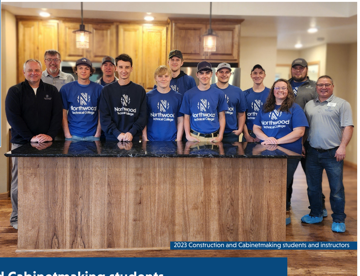
2023 Construction and Cabinetmaking students and instructors