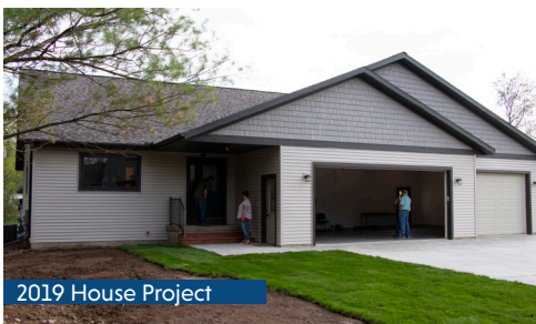
2019 House Project

"Having 20 student-built houses in our community is really a testament to the quality of Northwood Tech's construction and cabinetmaking program,"