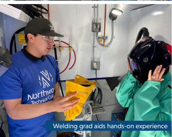
Welding grad aids hands-on experience

"The welding program gave a chance for someone like me, who works full-time and lives too far away from any college, to learn a new skill. I now can help my tribe in my [current] job or help me in a new welding job."