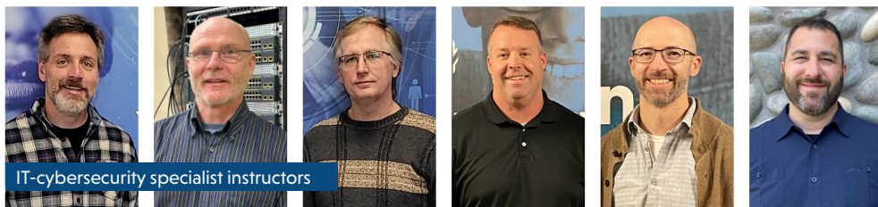
IT-cybersecurity specialist instructors

Northwood Technical College's information technology – cybersecurity specialist program is now recognized as a top-choice training program by the U.S. government after earning the designation through the Centers of Academic Excellence in Cyber Defense (CAE-CD) program.