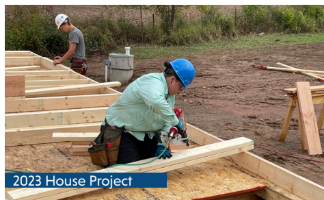
2023 House Project