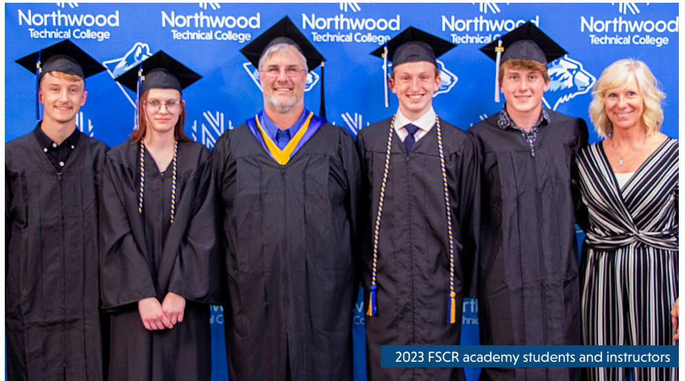
2023 FSCR academy students and instructors