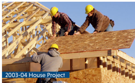
2003-04 House Project

For more information about the construction and cabinetmaking program and apprenticeships at Northwood Tech, visit NorthwoodTech.edu .